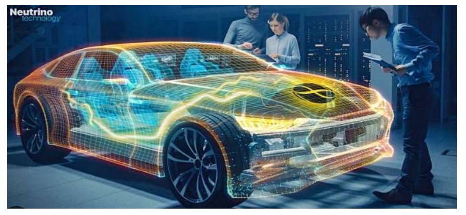
In the Pi car, the neutrinovoltaic technology is embedded in the carbon body in up to 100 layers, and cavities are filled with this special metamaterial. At an outside temperature of approx. 20 °C, the electricity generated in this way in one hour is sufficient for a driving distance of approx. 80-100 km. Compared to previous electric cars, the total battery pack can be smaller, saving space and costs.

Neutrino technology is suitable for decentralised energy supply, but